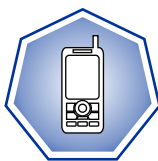
CELL PHONE/ 3GPP