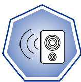
2 WAY AUDIO